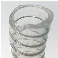
外观: 内外壁光滑 smooth inner and outer walls