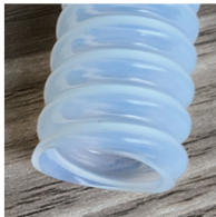
外观: 透明波纹 Transparent ripple