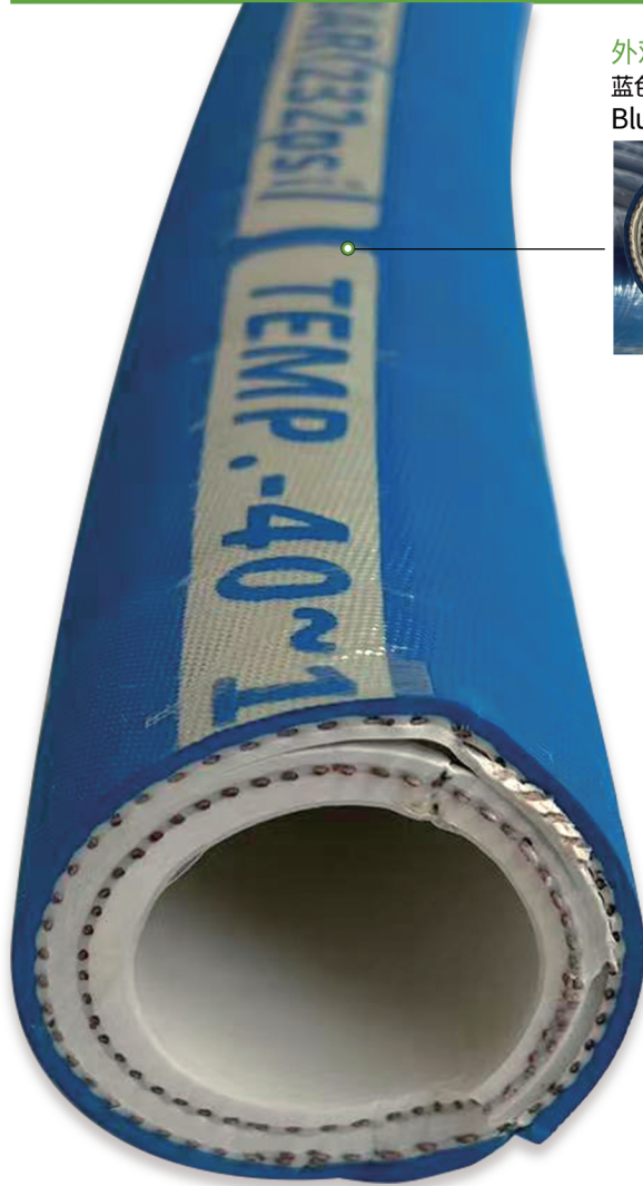
外观： 蓝色布纹 Blue woven design