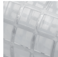
外观： 内外壁光滑 smooth inner and outer walls