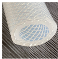
外观: 透明光滑 Transparent and smooth