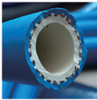
外观: 蓝色光滑 Blue smooth